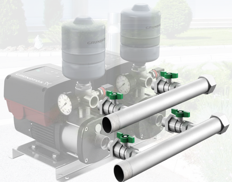
Inlet/Outlet Pipe kit for CMBE TWIN

Inlet/Outlet Pipe kits are available for the CMBE TWIN booster for easy installation of an Inlet/Outlet pipe. The pipe kits include ball valve and unions and 1½" outlet connection.